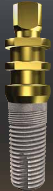
3.7mmD Internal Bevel