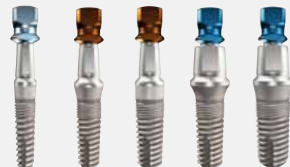
SwissPlant 3.3/3.7 SwissPlant 4.1/4.8 SwissPlant 4.8/4.8 SwissPlant 4.8/6.5 SwissPlant 5.7/6.5

SwissPlant Implants with progressively deeper threads. Packaging includes cover screw, healing collar, transfer and abutment