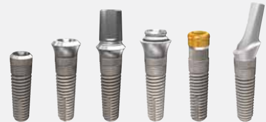
ScrewPlant® ScrewPlus® ScrewDirect® ScrewIndirect® GoDirect™ ScrewRedirect®

Application specific 1- and 2-piece Implants with all-in-one packaging Same implant body and surgical protocol for all six Implants