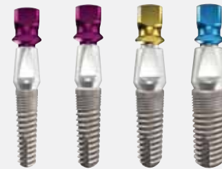
ReActive® 3.7/3.5 ReActive 4.2/3.5 ReActive 4.7/4.3 ReActive 5.7/5.0

ReActive Implants with progressively deeper threads. Packaging includes cover screw, transfer and abutment