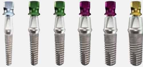
Legacy3 3.2/3.0 Legacy3 3.7/3.5 Legacy3 4.2/3.5 Legacy3 4.7/4.5 Legacy3 5.2/4.5 Legacy3 5.7/5.7

Legacy3 Implants with progressively deeper threads. Packaging includes cover screw, healing collar, transfer and abutment