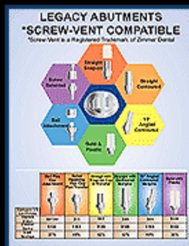
Prosthetic Catalog for Zimmer's Screw-Vent Implant