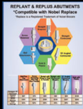
Prosthetic Catalog for Nobel Biocare's Tri-lobe Implants