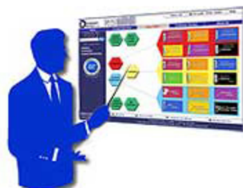
Online Ordering Tutorial

IMPLANT DIRECT RECEIVES FDA MARKETING APPROVAL FOR ENTIRE SPECTRA-SYSTEM!