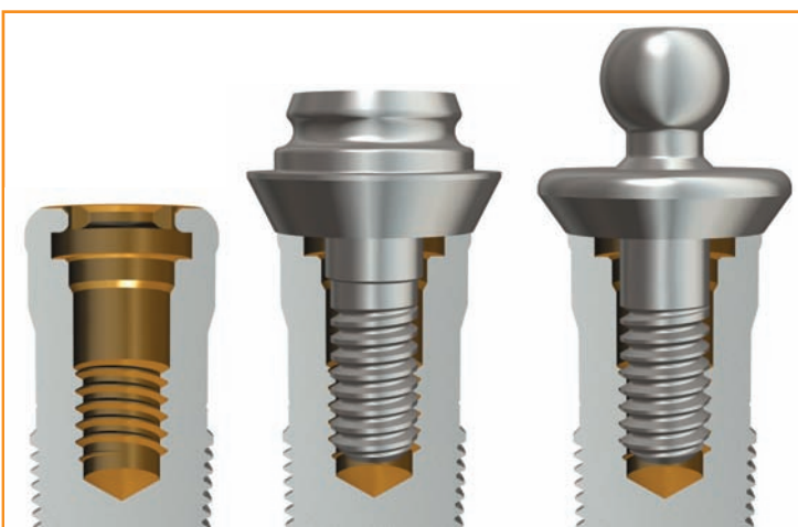
GoDirect™ implant with internal screw removed and Screw-Receiving Top or Ball Top then attached