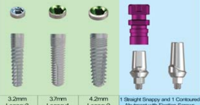
3.2mm Legacy3, 3.7mm Legacy1, 4.2mm Legacy2, 1 Straight Snap-On and 1 Contoured Abutment with Fixation Screws