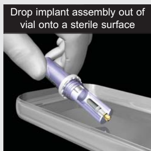
Drop implant assembly out of vial onto a sterile surface