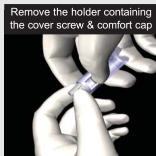
Remove the holder containing the cover screw & comfort cap