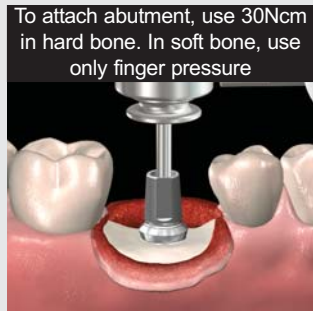
To attach abutment, use 30Ncm in hard bone. In soft bone, use only finger pressure