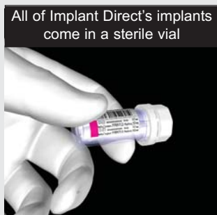
All of Implant Direct's implants come in a sterile vial