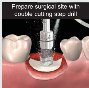
Prepare surgical site with double cutting step drill

The RePlant, RePlus and ReActive Implants are mounted on color-coded fixture-mounts, designed for use as implant level transfers or shortened to function as an abutments. A cover screw is included in each vial. The RePlus fixture-mount is provided with a snap-on comfort cap.