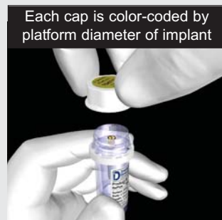
Each cap is color-coded by platform diameter of implant