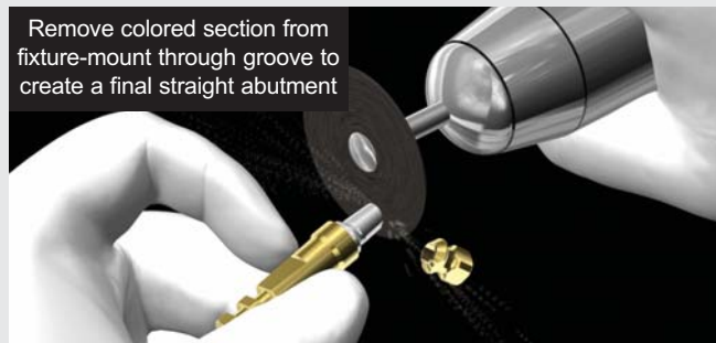
Remove colored section from fixture-mount through groove to create a final straight abutment