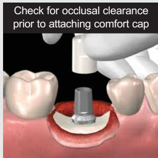
Check for occlusal clearance prior to attaching comfort cap