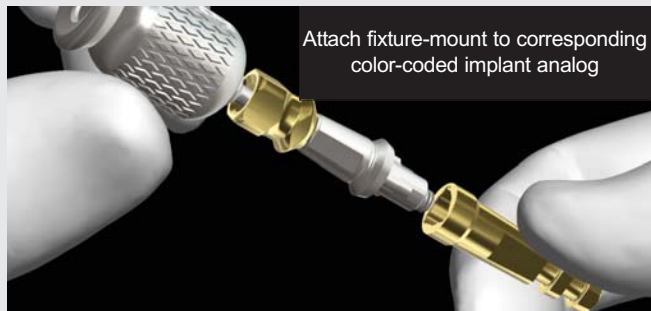
Attach fixture-mount to corresponding color-coded implant analog