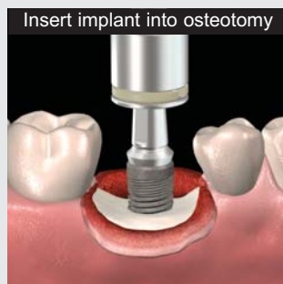
Insert implant into osteotomy