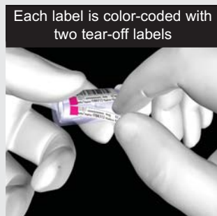
Each label is color-coded with two tear-off labels