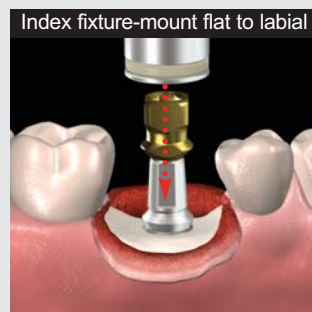
Index fixture-mount flat to labial