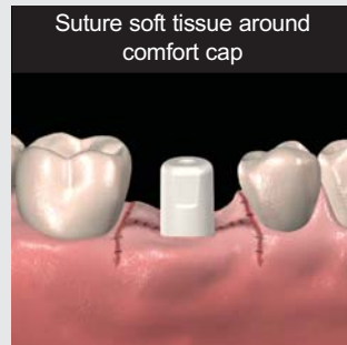
Suture soft tissue around comfort cap