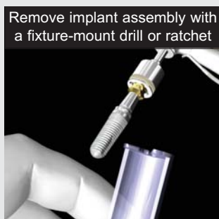
Remove implant assembly with a fixture-mount drill or ratchet