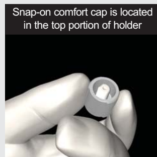
Snap-on comfort cap is located in the top portion of holder