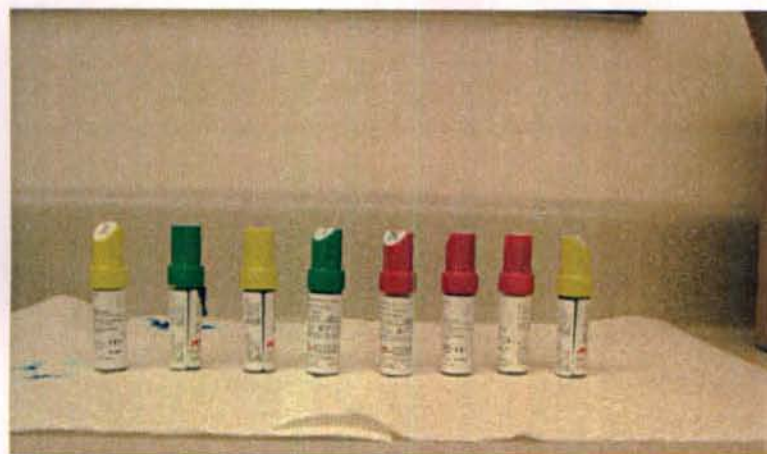
After testing (control is 2 nd from left)