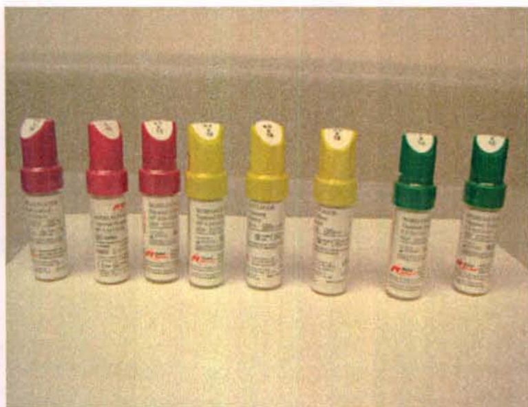
Before dye immersion testing