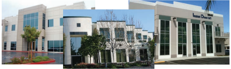
Implant Direct Sybron International's facilities in California and Nevada.